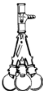
TGDH - 27

TGDH-27 Distilling Receiver Multiple with Straight. (available with adapters & conical distributing adapter) without Flask.