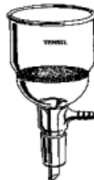
TGFi - 9