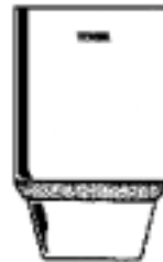
TGF i -3