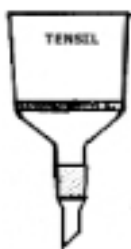
TGF-i - 11