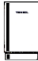
TGF i - 2