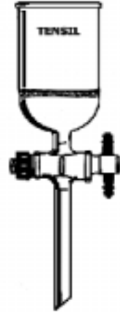
TGFi - 8