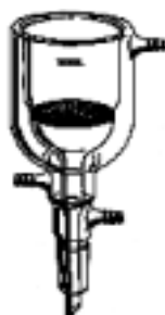
TGF-i - 10